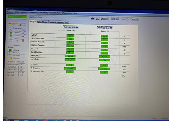
Figure 5. Normal Parameter Conditions in PMDT

Then, the technician jumps pin 3 to pin 8 (without using an IC) and checks again on another circuit. Normal parameter condition in PMDT is illustrated in Figure 5.