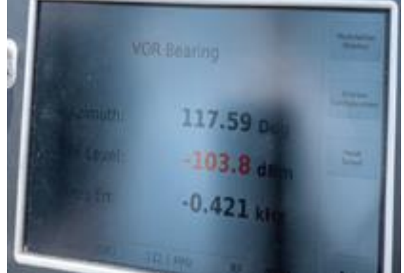
Figure 1. Results of checking antenna transmission on PIR

Next, the technician checked the Antenna Field Monitor, by lowering the antenna and checking the impedance value using an Avometer and getting an abnormal impedance value of 80 ohms, then the technician checked the antenna transmission cable from the field monitor using the PIR Antenna as a replacement for the Antenna Field Monitor. These procedures are based on earlier research that was carried out after the equipment damage operation and was obtained from the results assessing the antenna reception parameters in abnormal conditions.