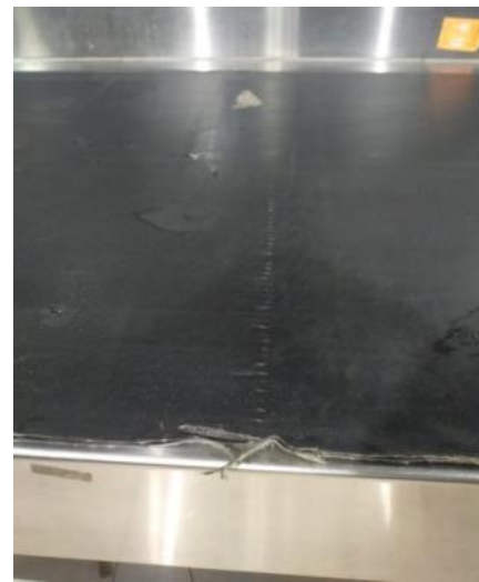
Figure 1. Conveyor belt damage

Factors that cause slip: First, an old belt can increase the likelihood of tearing because the elasticity of the strap has decreased since it was first used. Second, a belt that has been used for a long time will also affect its condition. The third is the lack of maintenance on the conveyor belt. Treatment that can be done to extend the life of the belt is to check the tension on the conveyor belt so that miss-tracking does not occur and clean the belt using a rag and a vacuum cleaner if there is water or dust attached to the belt (Trojan & Marçal, 2017). Fourth, there is heavy pressure on the conveyor belt. If the belt carries too much pressure, it will increase the belt tension so that the friction on the belt is also more significant and can cause tearing (Lubis et al., 2022).