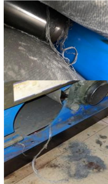
Figure 6. The inside of the belt

Then, check the inside of the belt conveyor with the help of a flashlight to see where the torn material is stuck.