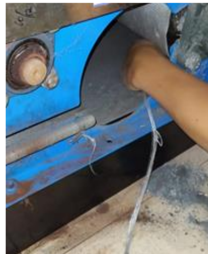
Figure 7. Cutting the damaged part of the Belt

After that, pull out the torn belt material stuck between the idler shafts and then cut it using a cutter.