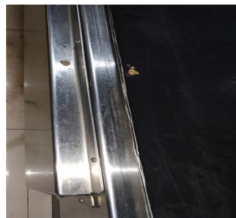
Figure 8. Frame closed