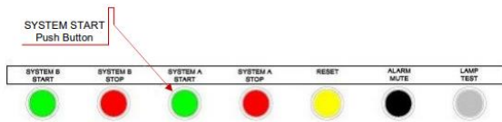
Figure 4. Start Button System

There are several steps to dealing with slips on the conveyor. First, ensure the conveyor is OFF by pressing the STOP button on the START system. Prepare a toolkit for disassembling the conveyor frame.