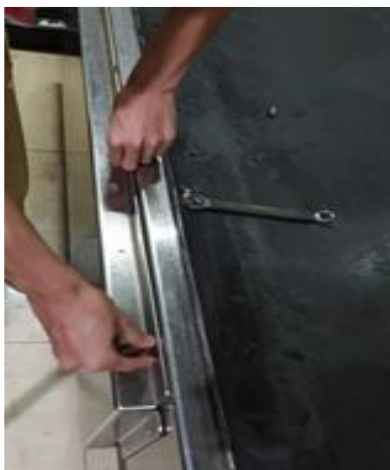
Figure 5. Frame dismantling process on the conveyor

Next, open one side of the frame using a screwdriver. Ensure all bolts removed are not scattered and do not get into the conveyor frame.